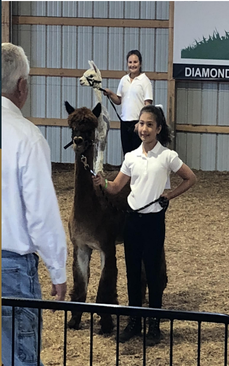
Showman looking at the judge