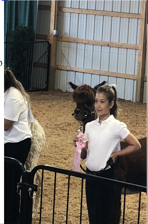
Showman demonstrating good sportsmanship